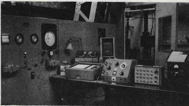
FIG. 4. Pressure and strain measurement equipment.